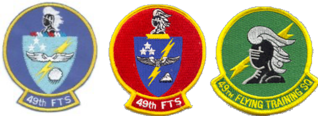
49 Flying Training Squadron patches