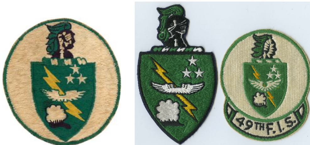
49 Fighter Interceptor Squadron emblems