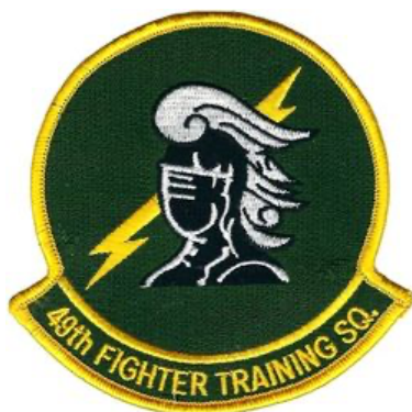
49 Fighter Training Squadron patch

49 Fighter Training Squadron emblem On a disc Vert, a lightning flash bendwise sinister throughout Or surmounted by a knight's helmet Sable, garnished Silver Gray and plumed Argent, all within a narrow border Yellow. Attached below the disc, a Green scroll edged with a narrow Yellow border and inscribed "49 FIGHTER TRAINING SQ" in Yellow letters.